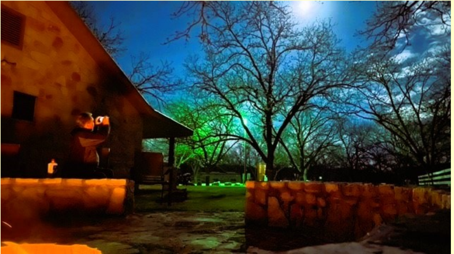
FRIO PECAN FARM @ NIGHT LEAKEY, TX