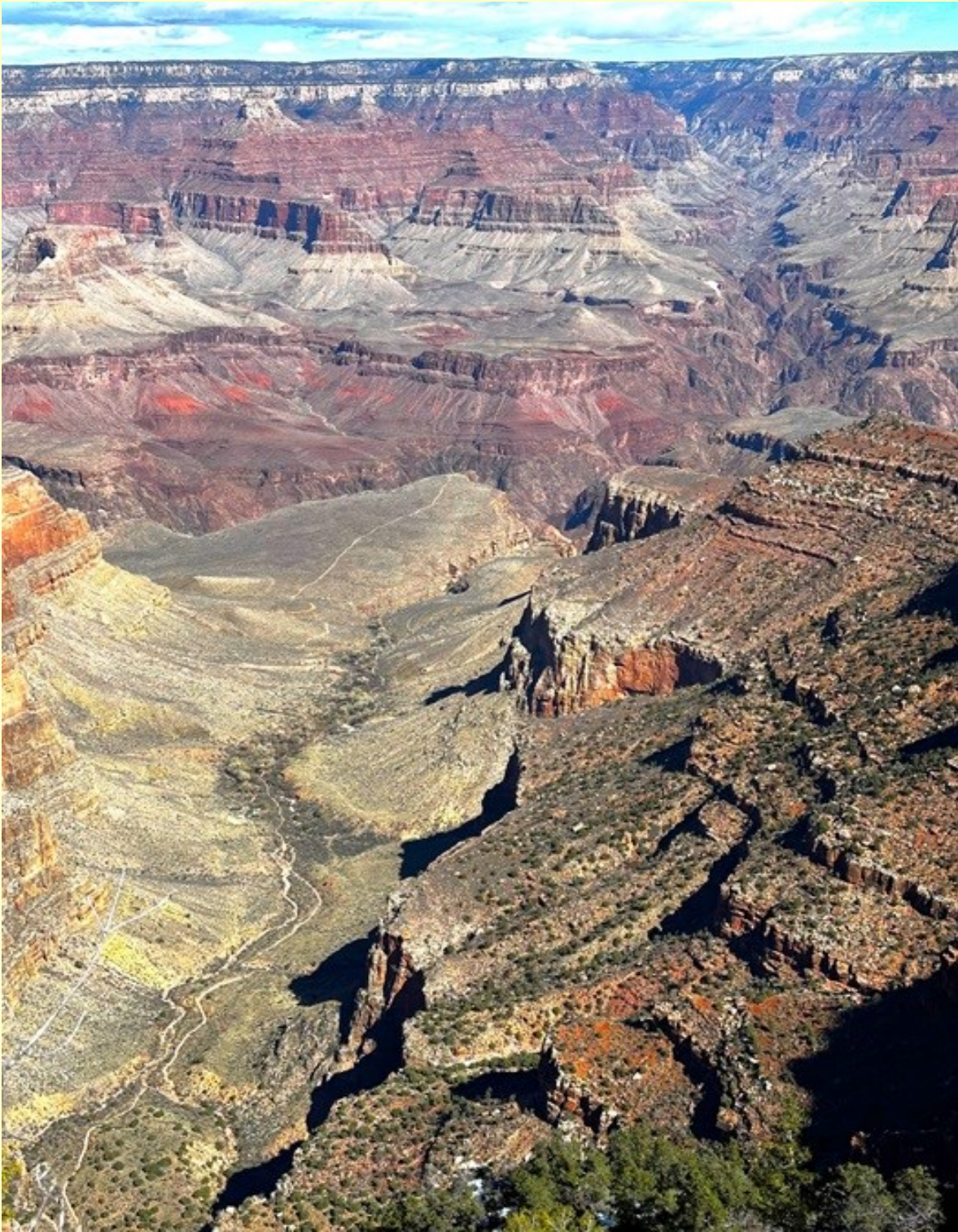
THE GRAND CANYON - RIM TO RIM (THE TRAIL THAT BEAT ME) by Bill Case