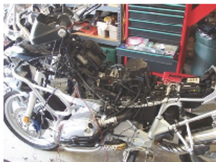
Was it the brown and white wire or??!!

available spanning the entire brand. Use this knowledge to your advantage and get the advice you need to get your project done.