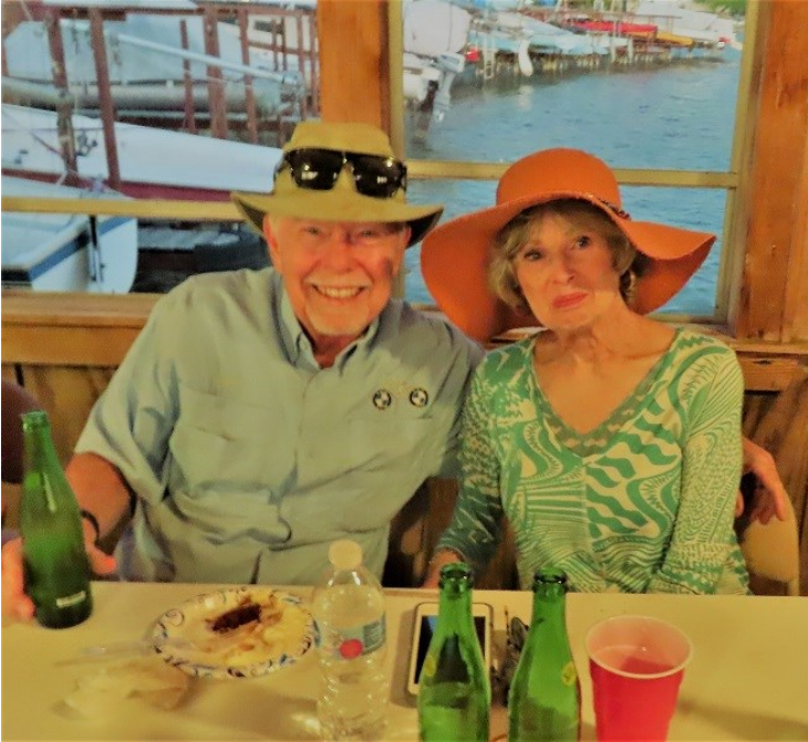
ASTRID KATTWINKEL'S PHOTO OF WHITE ROCK LAKE FROM THE CLUB DOCK