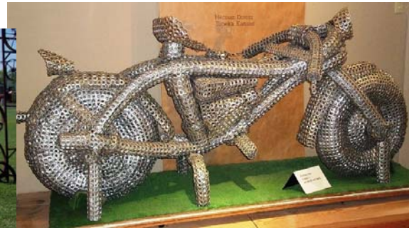
THE PULL TAB MOTORCYCLE